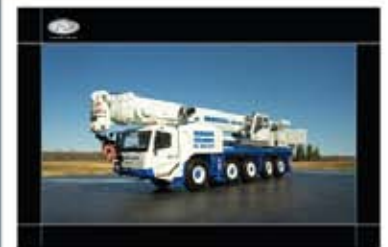
PRODUCT: GROVE® 5110-1 HANCHARD CRANES POSTER