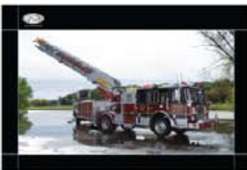
PRODUCT: SEAGRAVE TRACTOR DRAWN AERIAL LEESBURG #601 POSTER