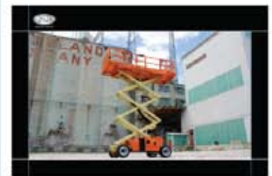
PRODUCT: JLG® 3394RT POSTER