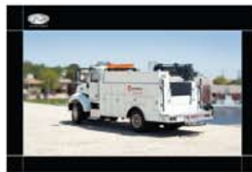
PRODUCT: PETERBILT MODEL 335 MECHANIC TRUCK MANITOWOC CRANE CARE POSTER