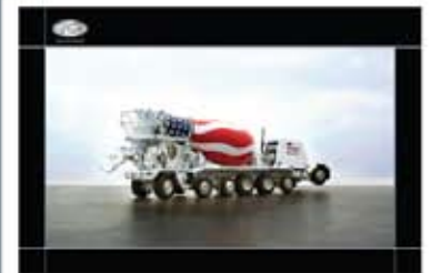
PRODUCT: OSHKOSH® S-SERIES™ BUILDING AMERICA POSTER