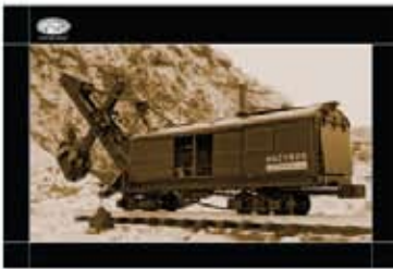
PRODUCT: BUCYRUS® STEAM SHOVEL POSTER

ALL POSTERS ARE PRINTED ON 1/8" (3mm) THICK, DOUBLE-WEIGHT MATBOARD THAT NOT ONLY GIVES THE PRINT EXTRA SUPPORT, BUT ALSO HELPS PRESERVE THE VALUE OF THE PRINT OVER TIME. A HIGH QUALITY, INDUSTRIAL BLACK METAL FRAME AND MOUNTING HARDWARE REQUIRING MINOR ASSEMBLY ARE INCLUDED.