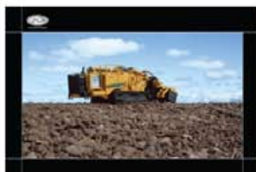
PRODUCT: VERMEER® T1255 TERRAIN LEVELER® POSTER