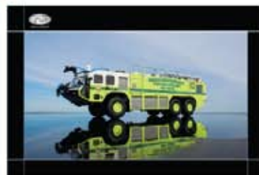
PRODUCT: OSHKOSH® STRIKER® 3000 ARFF WASHINGTON D.C. POSTER