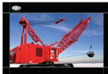
PRODUCT: MANITOWOC 4100W DRAGLINE POSTER