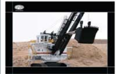
PRODUCT: BUCYRUS® 495HR POSTER