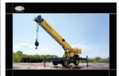
PRODUCT: GROVE® RT540E POSTER