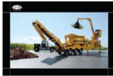
PRODUCT: VERMEER® TG7000 TUB GRINDER POSTER

MERCHANDISING TIP: CHANGE OUT YOUR POSTERS FREQUENTLY TO ADD VARIETY AND EXCITEMENT TO THE RETAIL EXPERIENCE. LIKE A WEBSITE, FREQUENT CHANGES WILL KEEP CUSTOMERS RETURNING TO SEE WHAT'S NEW.