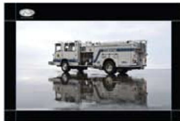
PRODUCT: PIERCE® QUANTUM® PUMPER KERN CO. #41 POSTER