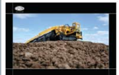
PRODUCT: VERMEER® T1255 HYDROSTATIC TRENCHER® POSTER