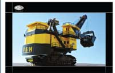
PRODUCT: P&H® 4100XPC POSTER