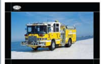
PRODUCT: PIERCE® QUANTUM® PUMPER HONOLULU #10 POSTER