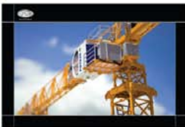
PRODUCT: POTAIN® MDT 178 POSTER