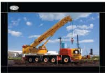
PRODUCT: GROVE® GMK5095 WIESBAUER POSTER