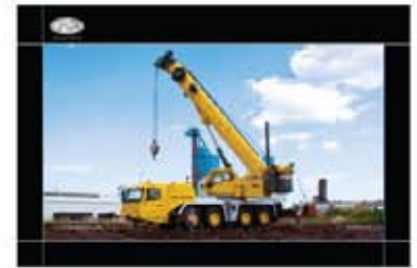
PRODUCT: GROVE® GMK4115L POSTER