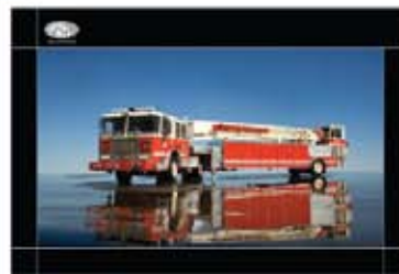
PRODUCT: SEAGRAVE TRACTOR DRAWN AERIAL NEW LONDON #25 POSTER