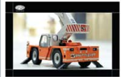
PRODUCT: SHUTTLELIFT® 5540F POSTER