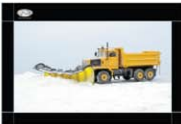
PRODUCT: OSHKOSH® P-SERIES™ POSTER