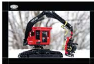
PRODUCT: VALMET 445 EXL POSTER