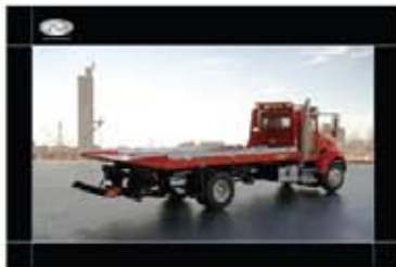
PRODUCT: JERR-DAN® STEEL SHARK POSTER

ALL POSTERS ARE PRINTED ON 1/8" (3mm) THICK, DOUBLE-WEIGHT MATBOARD THAT NOT ONLY GIVES THE PRINT EXTRA SUPPORT, BUT ALSO HELPS PRESERVE THE VALUE OF THE PRINT OVER TIME. A HIGH QUALITY, INDUSTRIAL BLACK METAL FRAME AND MOUNTING HARDWARE REQUIRING MINOR ASSEMBLY ARE INCLUDED.