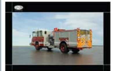
PRODUCT: PIERCE® QUANTUM® PUMPER SAN ANTONIO #6 POSTER