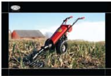
PRODUCT: GRAVELY® LEGENDARY L POSTER