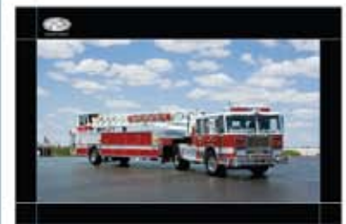
PRODUCT: SEAGRAVE TRACTOR DRAWN AERIAL REDWOOD CITY #9 POSTER