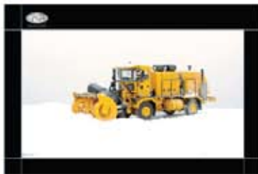
PRODUCT: OSHKOSH® H-SERIES™ POSTER

ALL POSTERS ARE PRINTED ON 1/8" (3mm) THICK, DOUBLE-WEIGHT MATBOARD THAT NOT ONLY GIVES THE PRINT EXTRA SUPPORT, BUT ALSO HELPS PRESERVE THE VALUE OF THE PRINT OVER TIME. A HIGH QUALITY, INDUSTRIAL BLACK METAL FRAME AND MOUNTING HARDWARE REQUIRING MINOR ASSEMBLY ARE INCLUDED.