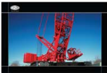
PRODUCT: MANITOWOC 16000 POSTER

REVIEW YOUR STORE ON A DAILY BASIS BY WALKING AROUND AS A PROSPECTIVE CUSTOMER WOULD. FACE MERCHANDISE TOWARD THE MAIN TRAFFIC AISLE, REORGANIZE AND MAKE SURE EVERYTHING IS IN GOOD CONDITION. ASK YOURSELF, "IF I WERE SHOPPING IN THIS STORE, WOULD I BE ENTICED TO BUY?"