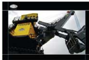
PRODUCT: P&H® 4100XPB POSTER