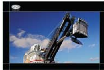
PRODUCT: BUCYRUS® 495HF POSTER