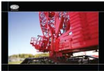
PRODUCT: MANITOWOC 18000 POSTER

ALL POSTERS ARE PRINTED ON 1/8" (3mm) THICK, DOUBLE-WEIGHT MATBOARD THAT NOT ONLY GIVES THE PRINT EXTRA SUPPORT, BUT ALSO HELPS PRESERVE THE VALUE OF THE PRINT OVER TIME. A HIGH QUALITY, INDUSTRIAL BLACK METAL FRAME AND MOUNTING HARDWARE REQUIRING MINOR ASSEMBLY ARE INCLUDED.