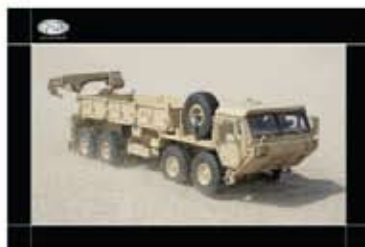
PRODUCT: OSHKOSH® HEMTT M985 A2 CARGO TRUCK POSTER