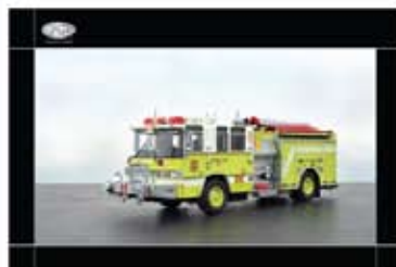
PRODUCT: PIERCE® QUANTUM® PUMPER CO. OF HENRICO #11 POSTER