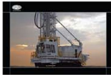
PRODUCT: BUCYRUS® 49HR BLASTHOLE DRILL POSTER