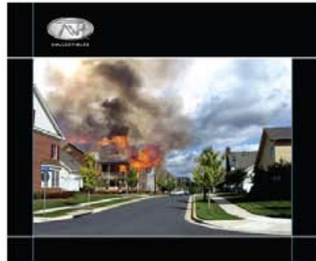
PRODUCT: FIRE/RESCUE DISPLAY BACKGROUND

Full: (TWH116-05008) $100.00 Half: (TWH116-05009) $90.00