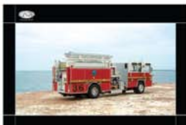
PRODUCT: PIERCE® QUANTUM® PUMPER SEMINOLE #36 POSTER