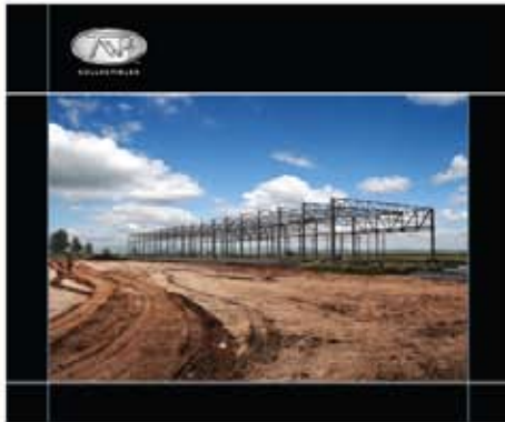
PRODUCT: CONSTRUCTION DISPLAY BACKGROUND

ACID-FREE BACKGROUNDS ARE MOUNTED ON 1/8" (3mm) THICK, DOUBLE-WEIGHT MATBOARD. ATTACHMENT STRIPS ALSO INCLUDED.