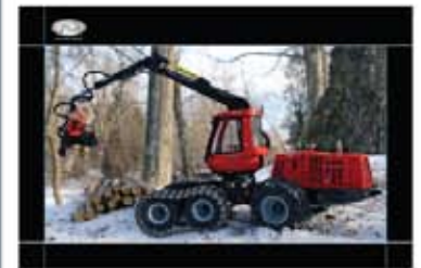
PRODUCT: VALMET 890.3 POSTER