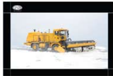
PRODUCT: SWEEPSTER S3100B POSTER