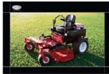
PRODUCT: GRAVELY® 260Z POSTER