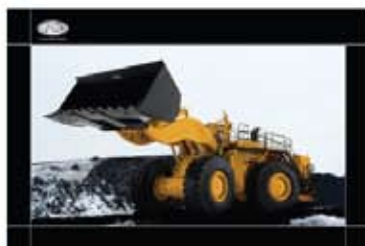
PRODUCT: LETOURNEAU TECHNOLOGIES™ L-1850 LOADER POSTER